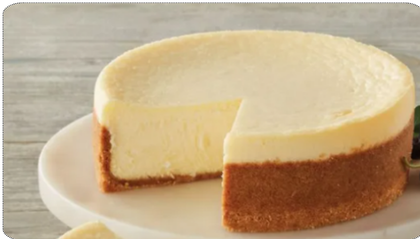
Springpan Graham cracker crumbs, follow directions and refrigerate

Make this your motto.. I am an unstoppable warrior who is strong and fearless. I live with courage and compassion in my heart. I wear my confidence like a shield to deflect all negativity. I am powerful and proud of who I am and what I do. I wake up each day positive and ready to take on the day ahead because I am on a mission to achieve my goals and nothing and no one can stop me.