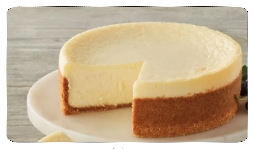
Springpan Graham cracker crumbs, follow directions and refrigerate Better when cake is made a full day before serving

2- 8oz pkg cream cheese, softened 1 cup sugar 1 pt sour cream 1 tsp vanilla 1 tsp lemon juice 5 eggs, room temperature